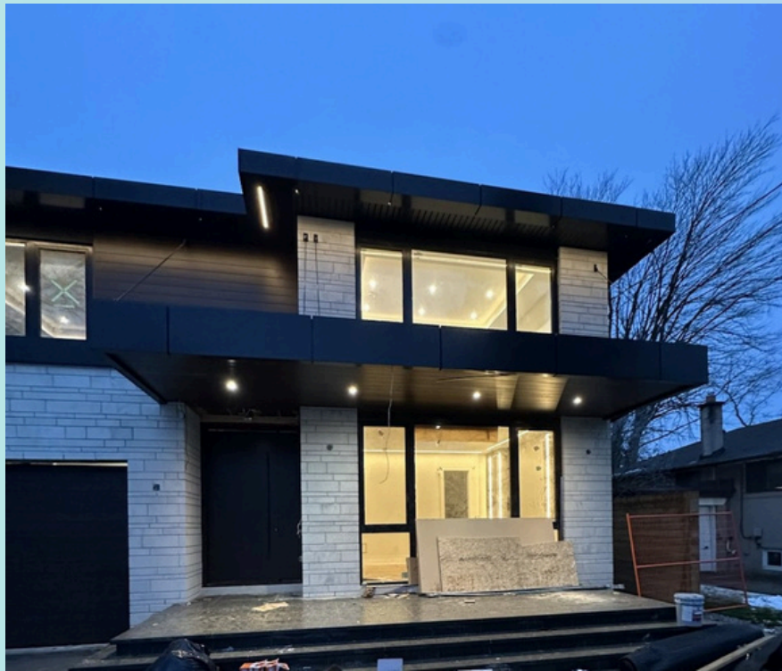
Modern Urban Residence

ACM AREA =1200 sq/ft WPC AREA =1500 sq/ft