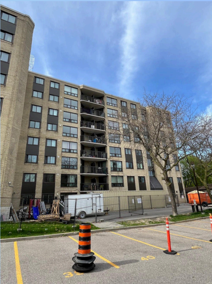
Modern Urban Residence