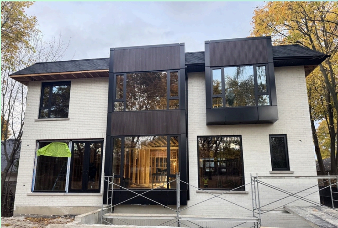
Modern Urban Residence

ACM AREA =1000 sq/ft WPC AREA =400 sq/ft