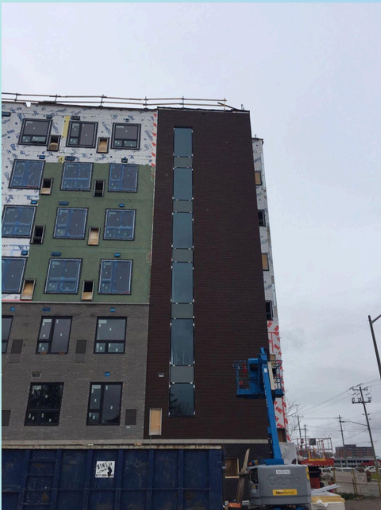
Modern Urban Residence

ACM AREA =1000 sq/ft WPC AREA =400 sq/ft