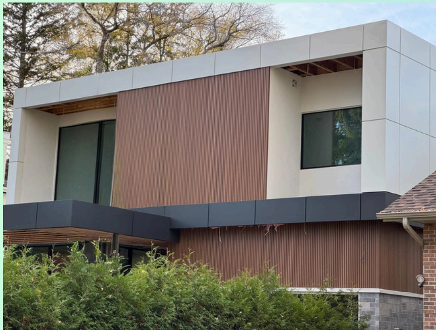
Modern Urban Residence

ACM AREA =1200 sq/ft WPC AREA =1500 sq/ft