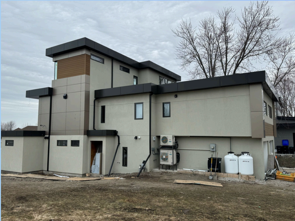
Modern Urban Residence

ACM AREA =1100 sq/ft WPC AREA =300 sq/ft